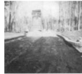
Mirafi® 500X used for separation under residential street