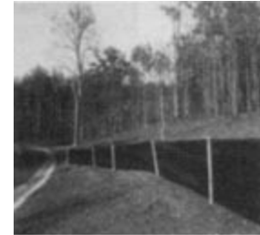
Mirafi® Silt Fence with posts used for sedimentation control

Mirafi® 600X is used for separation and stabilization over very weak subgrades; and separation, confinement, and reinforcement for critical roadways and site construction where very coarse, angular, and abrasive base material is required. Mirafi® 600X provides stabilization and reinforcement when heavy loads are expected. Mirafi® 600X is effective in the construction of low embankments over weak subgrades, eliminating the need for costly excavation and replacement with expensive fill. Mirafi® 600X meets AASHTO M288-96 Specifications for Stabilization and Separation - Class 1.