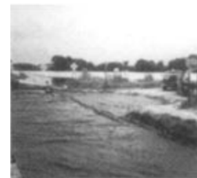
Mirafi® 600X used for stabilization in roadway repair