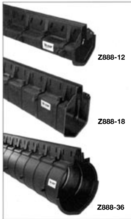
Hi-Cap – Slotted linear low density polyethylene drainage consisting of three different sizes.