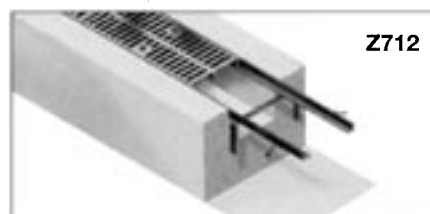
Frames & Grates – 6", 8", 10", 12", 14", 18", and 24" availability for cast-in-place installations.