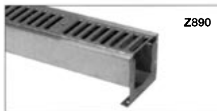
Sani-Flo – 6", 12" slotted stainless steel drainage systems, catch basins, plus custom trenches.