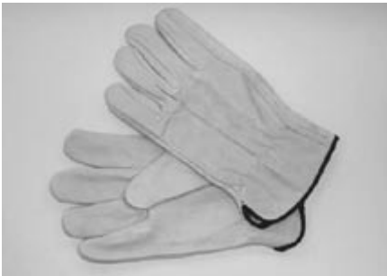
1700KS-TOP-GRAIN LEATHER, COW HIDE PULL-ON, KEYSTONE THUMB