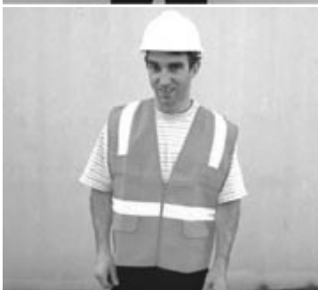
Cloth Safety Vests: Lime or Orange

D0047VST-NYLON MESH SAFETY VEST WITH REFLECTIVE STRIPES