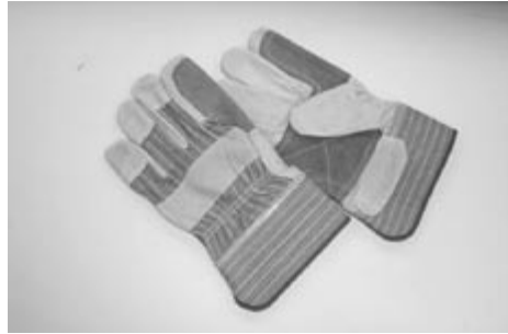
1100DP-DOUBLE PALM, SAFETY CUFF, RUBBERIZED