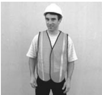
Mesh Safety Vests: Lime or Orange

D0047VST-NYLON MESH SAFETY VEST WITH REFLECTIVE STRIPES