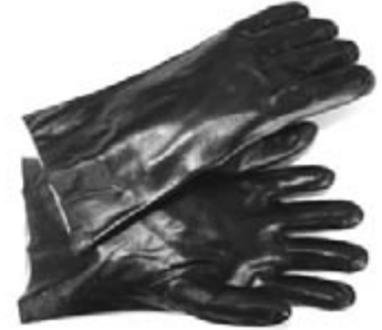
2100-P.V.C. COATED, 12" P.V.C