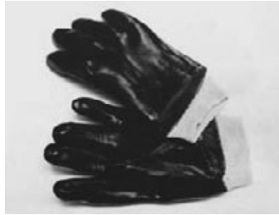
2300-P.V.C. COATED GLOVES, KNIT WRIST