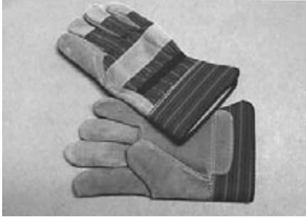
1100E-LEATHER PALM, SAFETY CUFF RUBBERIZED, A GRADE