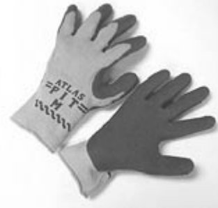
ATLAS300-M, L, XL: RUBBER COATED PULL DURABLE, MULTI-PURPOSE, GREAT GRIP!