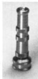
Solid Brass "No Drip" Twist Nozzle