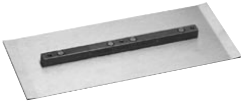
Finish Blade for 36" (91,44cm) Machine— 6 X 14 (15,24cm X 35,56cm) EDI Number 17336 Part Number M6093

Among the replacement blades for your power trowel are: