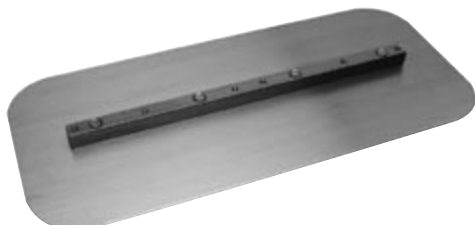
Flat Finish Power Trowel Blades-Round Corners— 8 X 18 (20,32cm X 45,72cm) EDI Number 17343 Part Number M7343