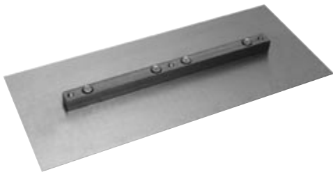
Flat Finish Power Trowel Blades— 6 X 14 (15,24cm X 35,56cm) EDI Number 17340 Part Number M7340