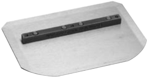
Combination Blade for 30" (76,20cm) Machine— 8 X 11 (20,32cm X 27,94cm) EDI Number 17230 Part Number M6219