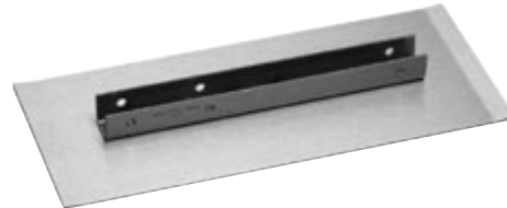
Master Finish Blade for 36" (91,44cm) Machine— 6 X 14 (15,24cm X 35,56cm) EDI Number 17636 Part Number M7636