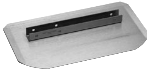
Master Combination Blade for 36" (91,44cm) Machine— 8 X 14 (20,32cm X 35,56cm) EDI Number 17536 Part Number M7536