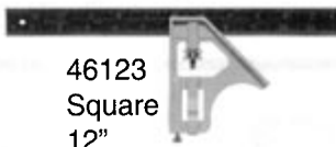
46123 Square 12" Combination