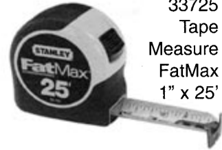
33725 Tape Measure FatMax 1" x 25'