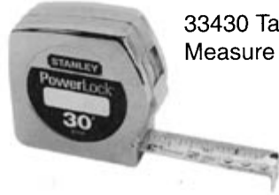
33430 Tape Measure 1" x 30'