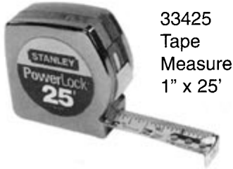
33425 Tape Measure 1" x 25'