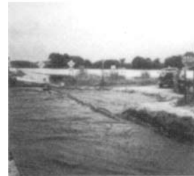
Mirafi® 600X used for stabilization in roadway repair