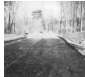
Mirafi® 500X used for separation under residential street