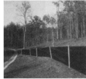
Mirafi® Silt Fence with posts used for sedimentation control

Mirafi® 600X is used for separation and stabilization over very weak subgrades; and separation, confinement, and reinforcement for critical roadways and site construction where very coarse, angular, and abrasive base material is required. Mirafi® 600X provides stabilization and reinforcement when heavy loads are expected. Mirafi® 600X is effective in the construction of low embankments over weak subgrades, eliminating the need for costly excavation and replacement with expensive fill. Mirafi® 600X meets AASHTO M288-96 Specifications for Stabilization and Separation - Class 1.