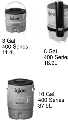
3 Gal. 400 Series 11.4L