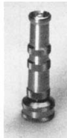
Solid Brass "No Drip" Twist Nozzle