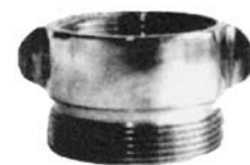
Increaser Rocker Lug