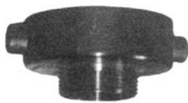
Reducer Pin Lug