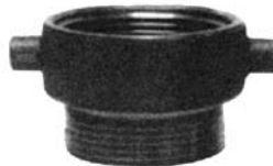
Same Size Both Ends